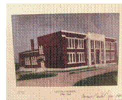
Lincoln School Painting $10.00